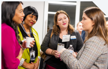
Women's Connect Networking Event, March 2024.